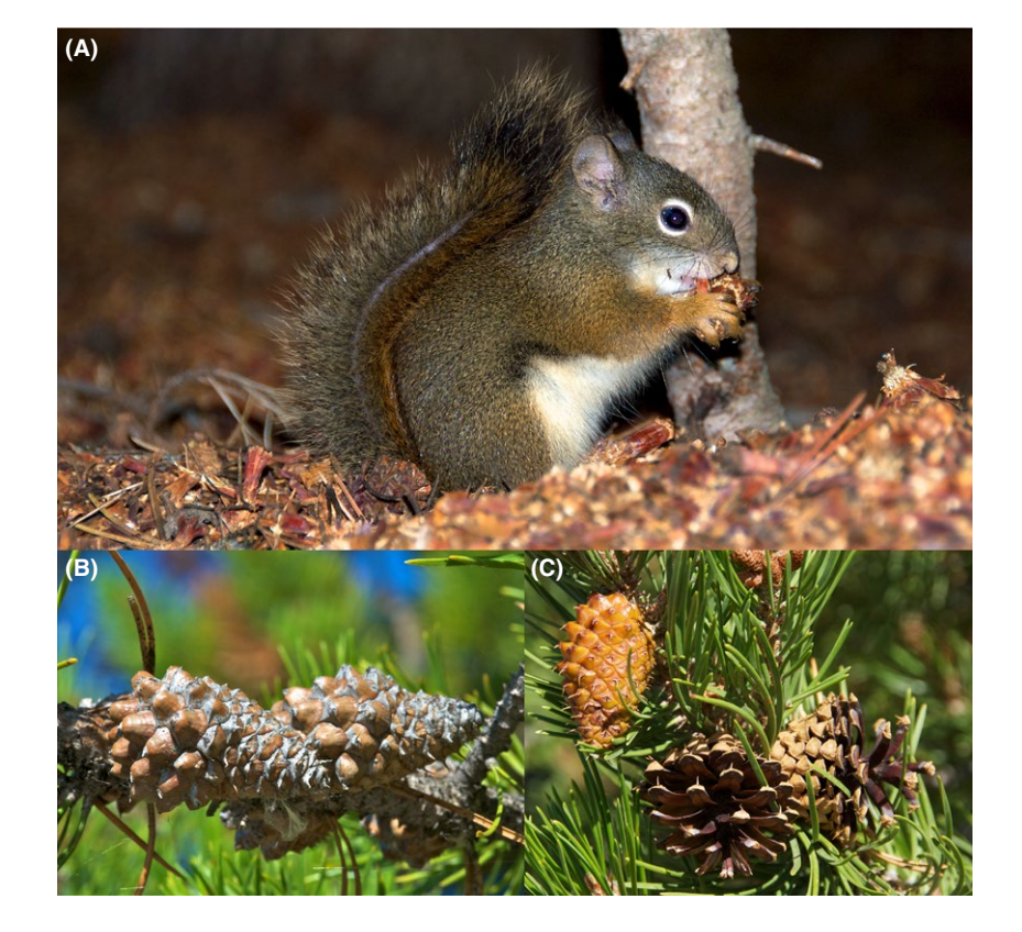
FIGURE 1 (A) A red squirrel ( Tamiasciurus hudsonicus ) eating a seed from a lodgepole pine ( Pinus contorta ssp. latifolia ) cone; only a few scales remain on the cone (on the distal end, directed downward). (B) Serotinous cones, which can remain closed for several decades unless removed by red squirrels or opened from heat of a fire. (C) Nonserotinous cones open in early autumn several weeks after the seeds mature; leftmost cone opened within weeks after photograph was taken.

Prior research shows that red squirrels (Fig. 1) select against serotiny by differentially preying on seeds in serotinous lodgepole pine cones, thereby depleting the arboreal seed bank (Talluto & Benkman, 2014). Moreover, cone serotiny is polygenic and heritable (Fig. 1B, C; Parchman et al., 2012) and thus should respond to selection. When red squirrel densities exceed one and half per hectare, past modeling suggests that selection by squirrels against serotiny overwhelms the selective pressure from fire favoring serotiny in Yellowstone (Talluto & Benkman, 2014). At lower squirrel densities, the balance between selection by fire and squirrels sets the frequency of serotiny (Talluto & Benkman, 2013, 2014); variation in the relative intensities of selection